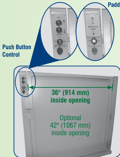
Gate with Push Button or Paddle Controls

Top Landing Gate With Push Buttons Control