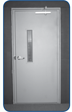
Flush Mount Steel Door