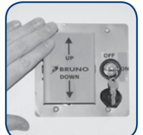
Flush Mount w/ Paddle Control