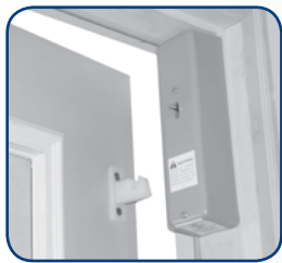
Electric Strike Interlock (gate or door not provided by Bruno)