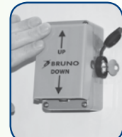
Surface Mount w/ Paddle Control

Landing Call/Send Surface Mount With Push Buttons Control Landing Call/Send Flush Mount With Push Buttons Control