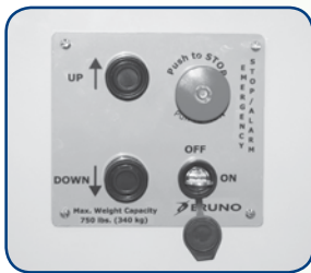
Push Button w/ Emergency Stop & Audio/Visual Alarm

Push Buttons Control With Emergency Stop (standard) Paddle Control With Emergency Stop