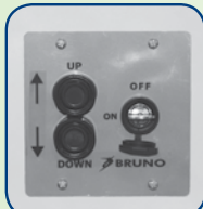
Flush Mount w/ Push Button

Landing Call/Send Surface Mount With Paddle Control Landing Call/Send Flush Mount With Paddle Control