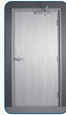
Flush Mount Oak Door

Flush Mount Steel Door With Window & Steel Frame (interlock included)