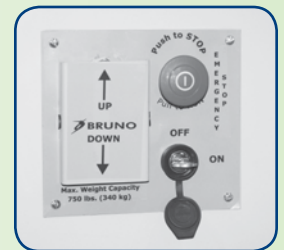
Paddle Control w/ Emergency Stop

Push Buttons Control With Emergency Stop And Audio/Visual Alarm Paddle Control With Emergency Stop And Audio/Visual Alarm