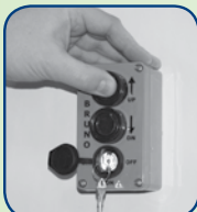
Surface Mount w/ Push Button