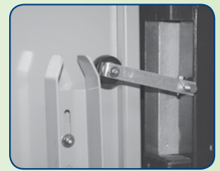
Electrical/Mechanical "GAL" Interlock (gate or door not provided by Bruno)

Interlock Wiring Kit (interlock & gate not provided by Bruno)